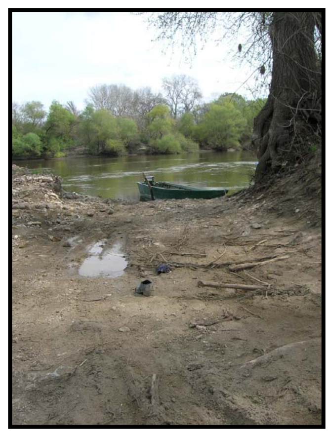
In 2011, more than 55,000 people were detained in the Greek-Turkish border region, having previously crossed the Evros border river. On the Greek side, between 80 and 90 corpses are found each year.

If you don't know the situation facing refugees in your own church or church district join together to do some research. Open days and mutual invitations help to build bridges. Inviting refugees and giving them an opportunity to speak heals our own society.